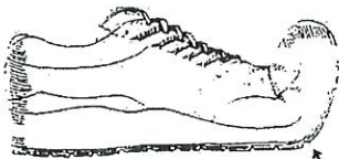
"Good" Flexion in Forefoot