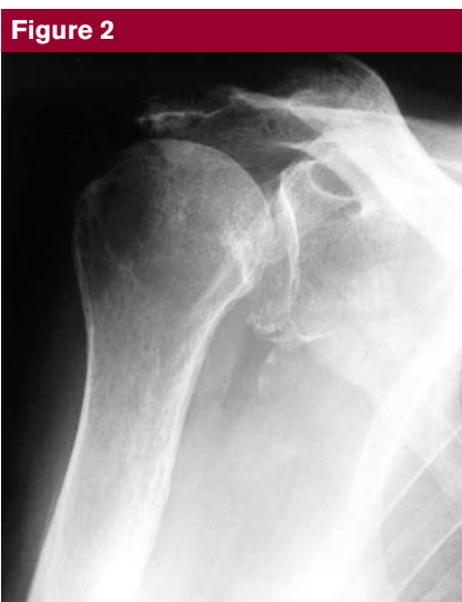
Neutral anteroposterior radiograph of a shoulder with a chronic massive rotator cuff tear. There is reduction of the acromiohumeral space, and the humeral head is elevated relative to the glenoid. (Reproduced from Green A: Chronic massive rotator cuff tears: Evaluation and management. J Am Acad Orthop Surg 2003;11:321-331.)

and limitations of selected treatment interventions to appropriately adjust the postoperative course of rehabilitation of each patient.