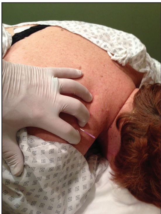
Figure 4. Supraspinatus teno-osseous junction needle insertion

DN of the infraspinatus muscle (Figure 5) was performed using flat palpation to identify the location of the tender nodule in the taught band of muscle located one-third the distance from the scapular