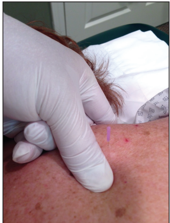
Figure 2. Levator Scapula teno-osseous junction needle insertion

DN of the supraspinatus muscle T-O junction (Figure 4) was performed using palpation to locate the tender nodule in the muscle belly. A 30 mm. needle was inserted toward the supraspinous fossa, where periosteal pecking (ten "taps") was performed just superior to the scapular spine. The needle was then left in-situ for 15 minutes.