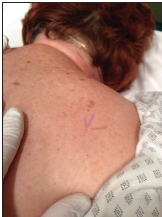
Figure 5. Infraspinatus muscle belly/teno-osseous junction needle insertion

DN of the infraspinatus muscle (Figure 5) was performed using flat palpation to identify the location of the tender nodule in the taught band of muscle located one-third the distance from the scapular