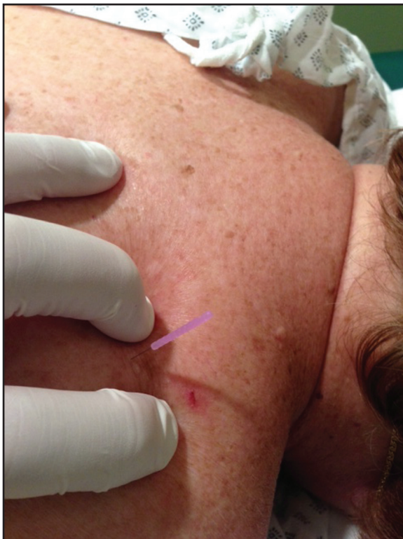
Figure 1. Levator Scapula musculoskeletal junction needle insertion

All DN was performed according to the Dry Needling Institute of the American Academy of Manipulative Therapy's current educational programing. 35 The patient was prone for all DN insertions. DN to the LS (Figure 1) was performed using a 30 mm. needle inserted through the muscle belly and tangential to the plane of the chest wall. The DN technique utilized ten fast-in/ out movements in a cone pattern to attempt to target as many sensitive loci as possible within the tender nodule in the taught band of muscle. The needle was then wound clockwise repeatedly to attain needle grasp and was left in-situ for 15 minutes.